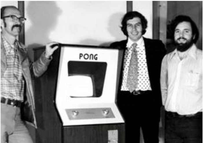
From left to right: Atari co-founders Ted Dabney and Nolan Bushnell, and engineer Allan Alcorn.

Bushnell turned to a Japanese term used in his favorite board game, Go. In that game, there is a polite warning that you give when you are about to take a number of your opponent's pieces. The phrase is "Atari." The Atari Company was formed on June 27th, 1972.